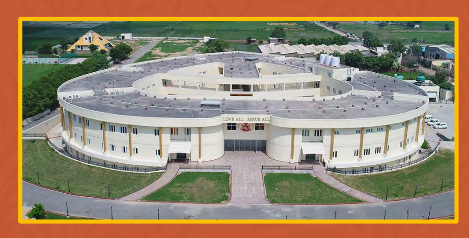
Mumbai, Maharashtra Nov 2018