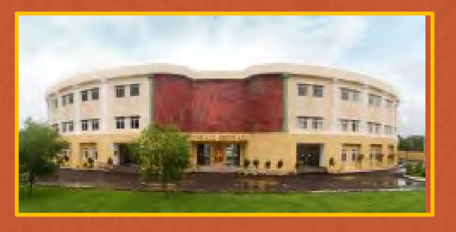
Palwal, Haryana Nov 2016